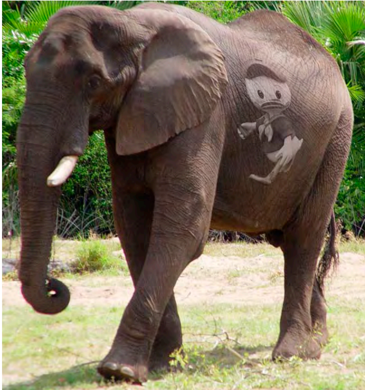
Louie Elephant A Photoshop Triumph!